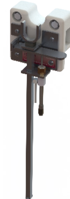
PAR-A-LIGN with optional BouMatic curb mounting block.