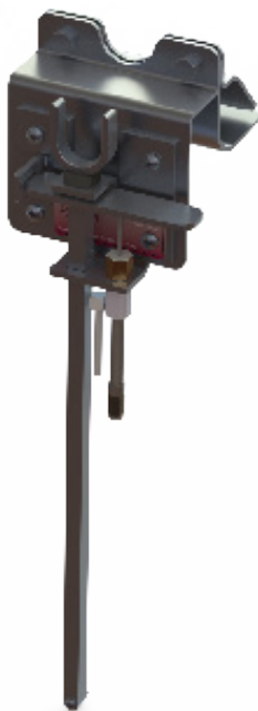
PAR-A-LIGN with optional DeLaval curb mounting block.